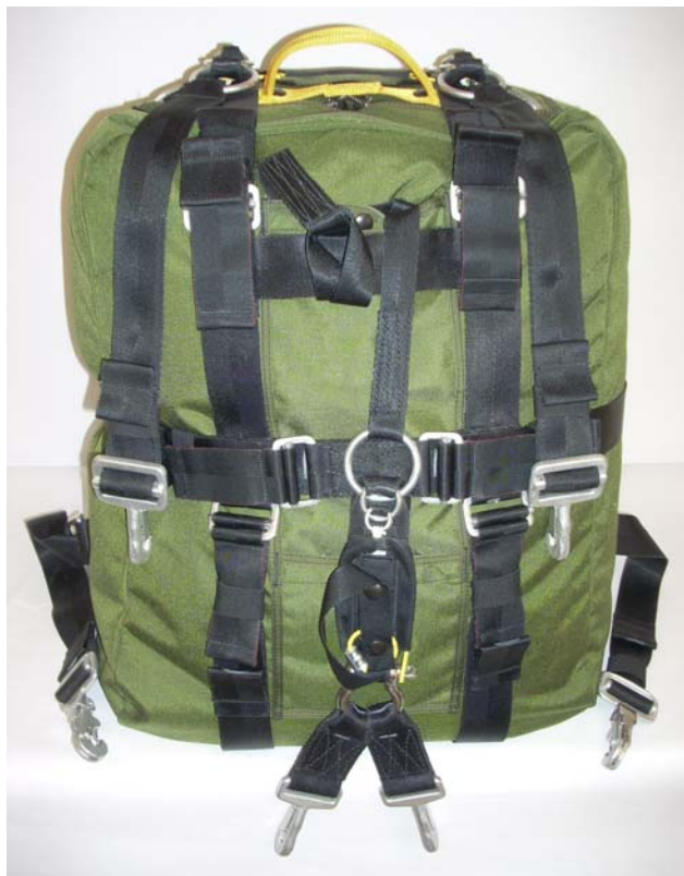
Back View of the TPDS-RRH-800