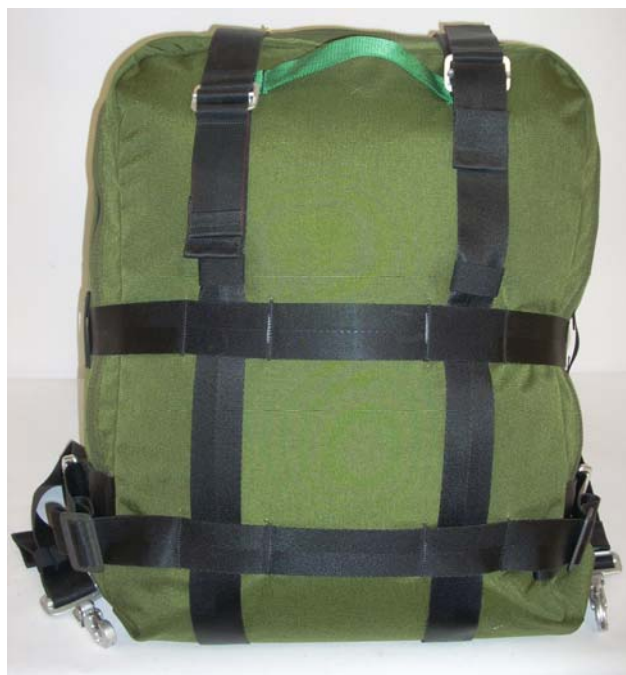
Front View of the TPDS-RRH-800