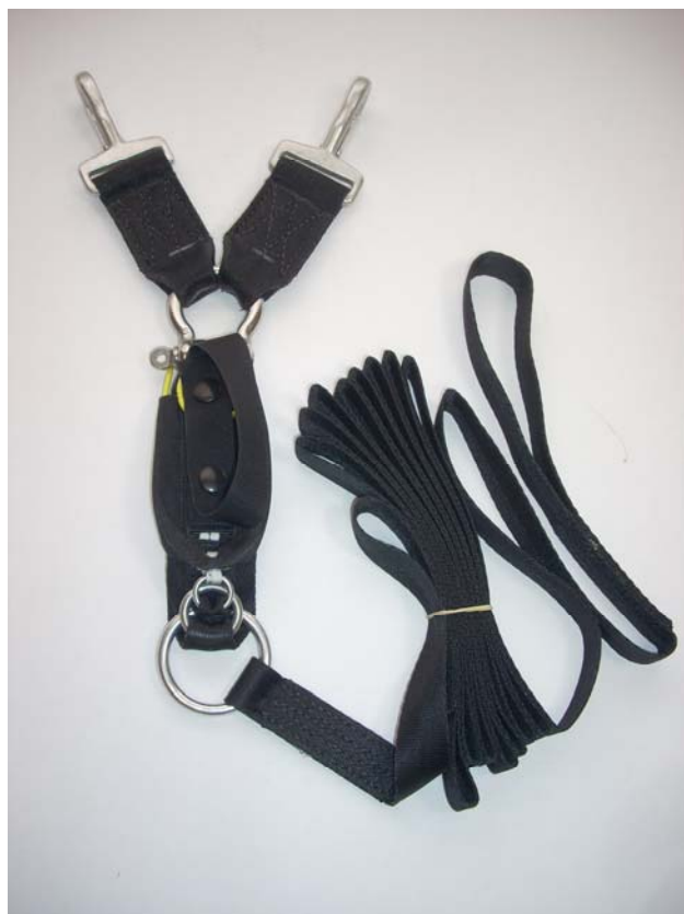
Drop-Line Assembly ( TPDS-RRH-112 )